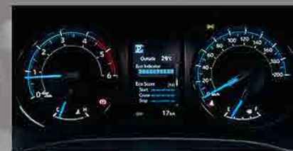
METER GAUGE + MULTI INFORMATION DISPLAY