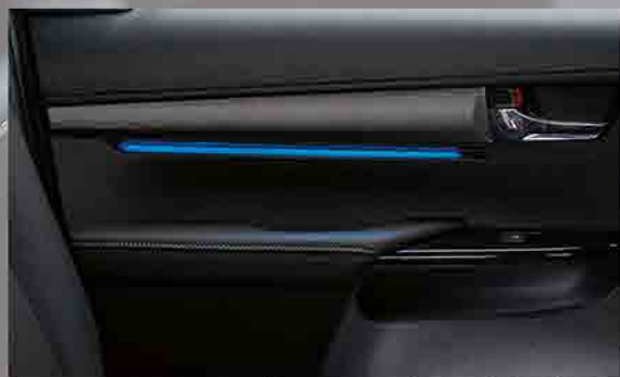
BLACK & GRAY INTERIOR WITH ILLUMINATION