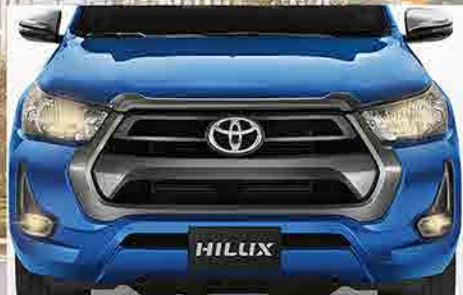
4-BULB HALOGEN HEADLAMPS • LED FOG LAMPS

With the new Hilux's upgraded styling and better fuel efficiency, you'll be ready to tough it out for longer while looking even better.