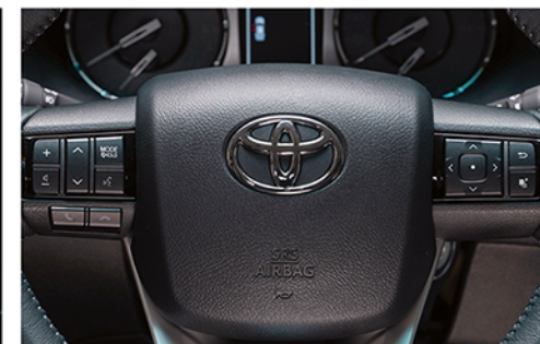
STEERING WHEEL SWITCH