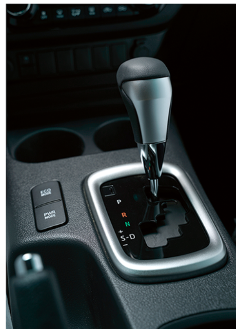
LEATHER SHIFT LEVER & KNOB 6 SPEED AT/MT TRANSMISSION