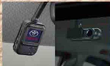
FRONT & REAR DIGITAL VIDEO RECORDER