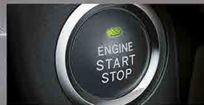
PUSH START BUTTON