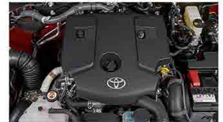
2.8L 1GD ENGINE WITH 201 HP MAX OUTPUT & 500 NM MAX TORQUE