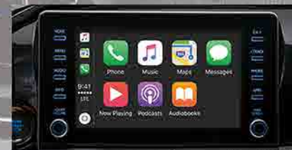
8" DISPLAY AUDIO WITH APPLE CARPLAY & ANDROID AUTO