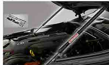
HOOD LIFT ASSIST