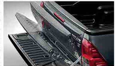
TAILGATE LIFT ASSIST