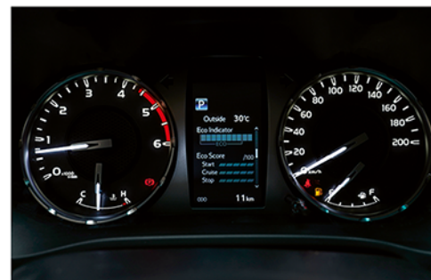
THIN FILM TRANSISTOR MULTI INFORMATION DISPLAY