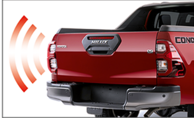
CLEARANCE SONAR* + BACK SONAR