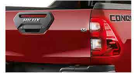
TAILGATE GARNISH LED REAR COMBINATION LAMPS