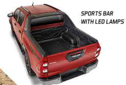
SPORTS BAR WITH LED LAMPS