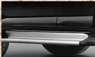
SIDE STEP BOARD