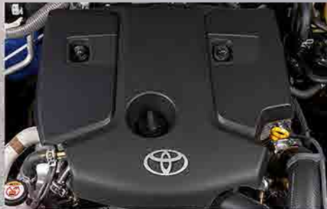
2GD-FTV KAI +5% FE IMPROVEMENT