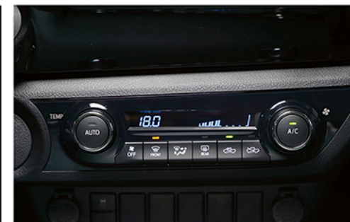
AUTO CLIMATE CONTROL*