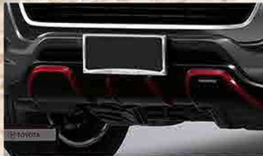
FRONT UNDER RUN