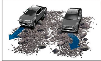
DOWNHILL ASSIST CONTROL ***