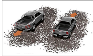
HILL START ASSIST CONTROL