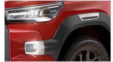
LED HEADLAMPS + FOG LAMPS OVERFENDER