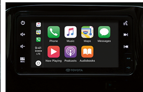
6.75" DISPLAY AUDIO WITH APPLE CAR PLAY & ANDROID AUTO