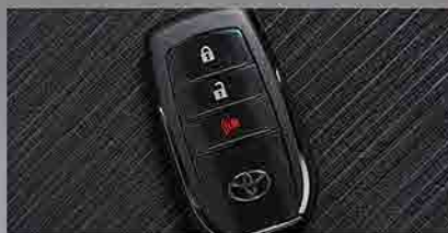
SMART KEY WITH HILUX BRANDING