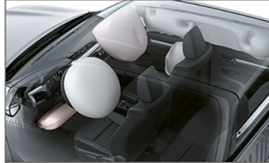
7 SRS AIRBAGS**