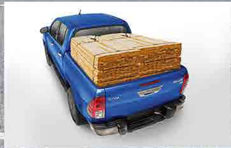
AMPLE DECK SPACE